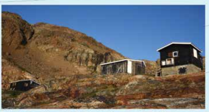
Sermilik Research Station.