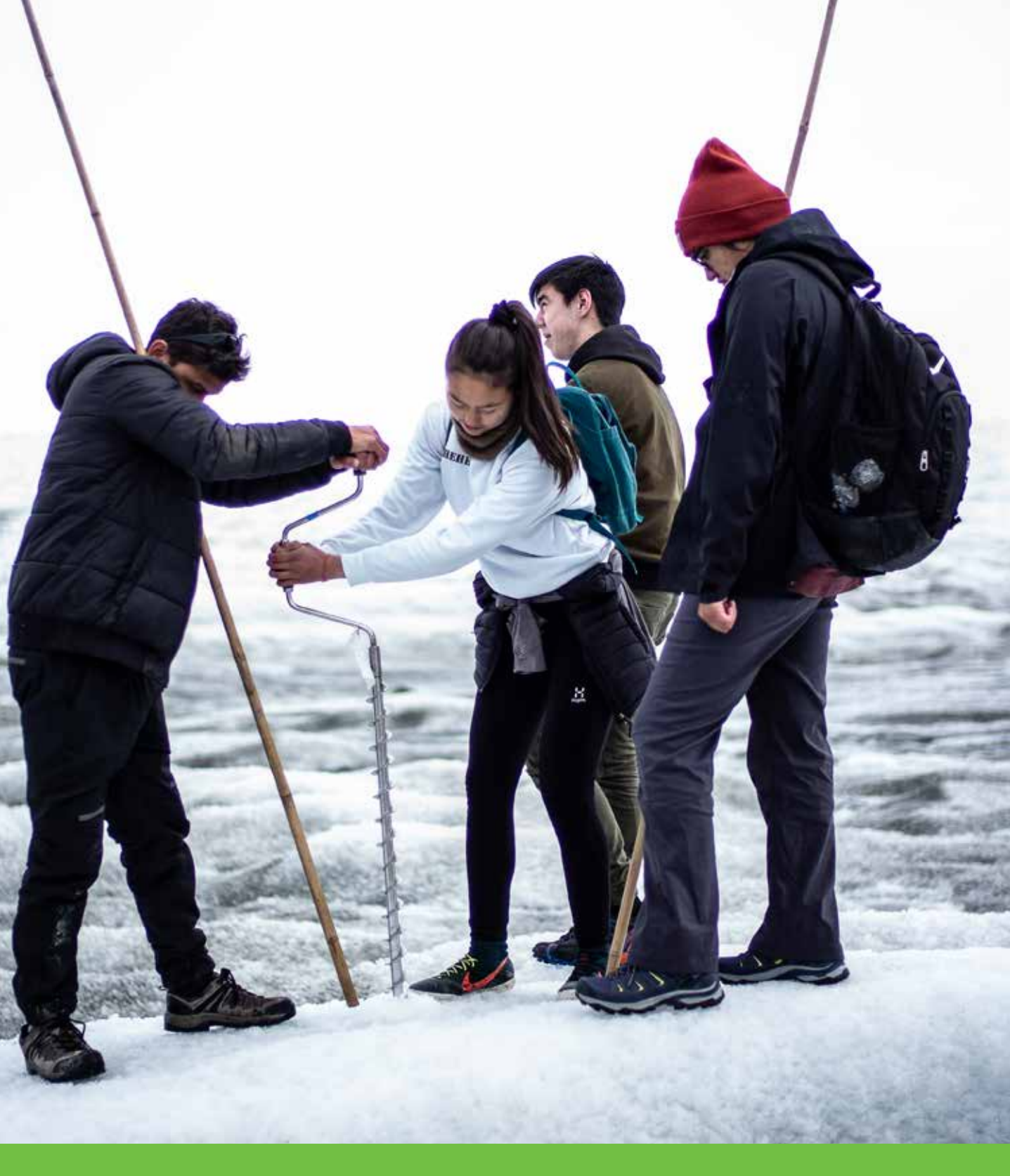
Students in JSEP, the Joint Science Education Project, drill a hole in the icesheet at point 660 to install an ablation stake.